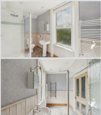
Low level WC, washbasin and waterfall shower cubicle, two heated towel rails and double glazed window to rear.