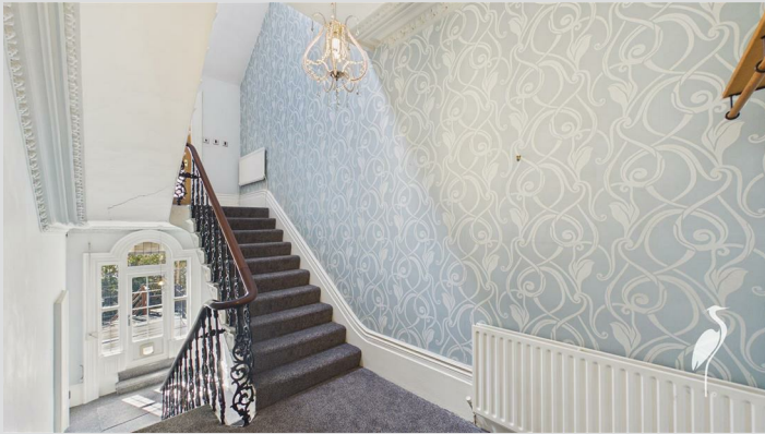
Radiator and door to shower room.