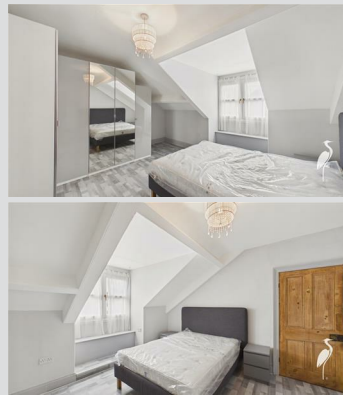
Double glazed window and radiator.