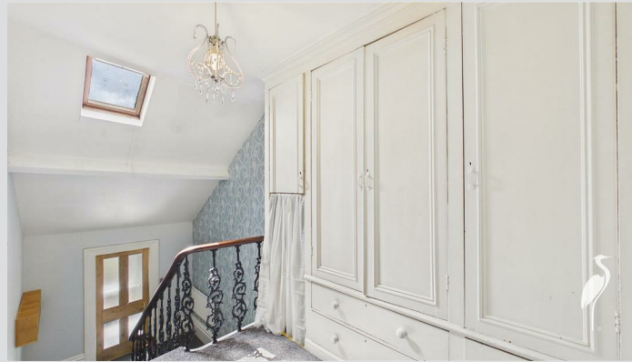
Velux window, built in storage and access point to loft.