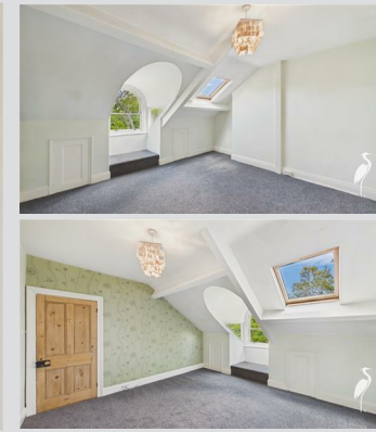
Velux window, single glazed segmental arched window and radiator.